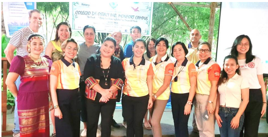
Membership & TRF Seminar... Sotogrande Hotel Oct. 8, 2022